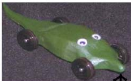
Painted car, very difficult to stage