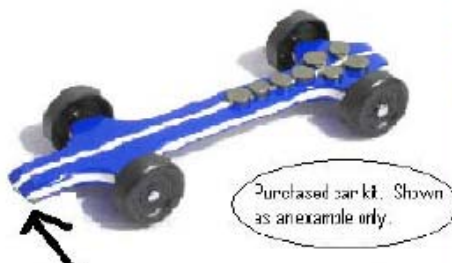
1/2 inch wide front edge, good for staging.